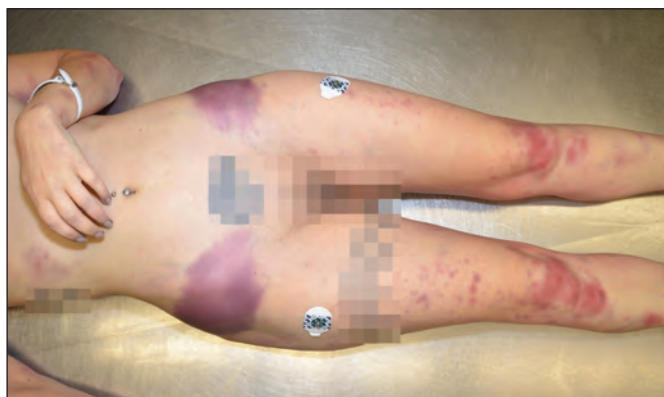
Figure 1. Hematoma caused by self-throwing on the ground as part of delirious behavior.