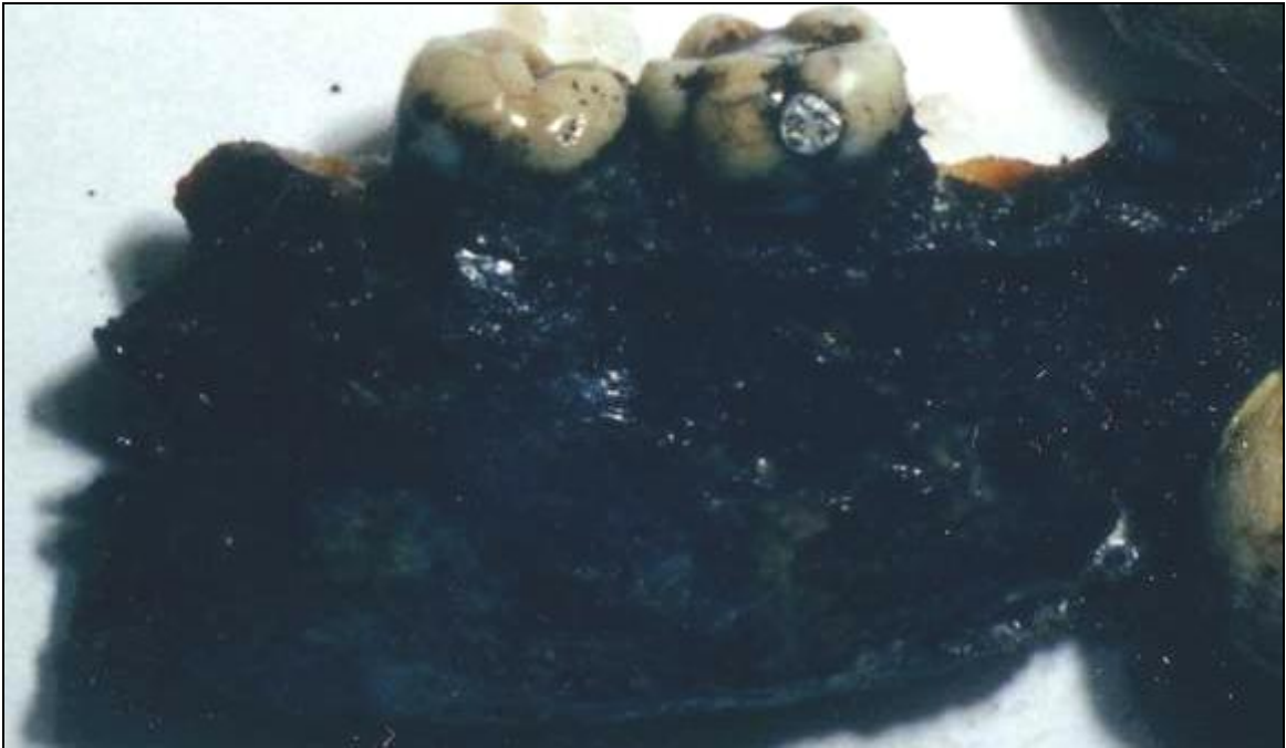
Photo 1 – right mandible fragment, – 45, 46, amalgam filling on vestibular face of 46; intense carbonization of the bone