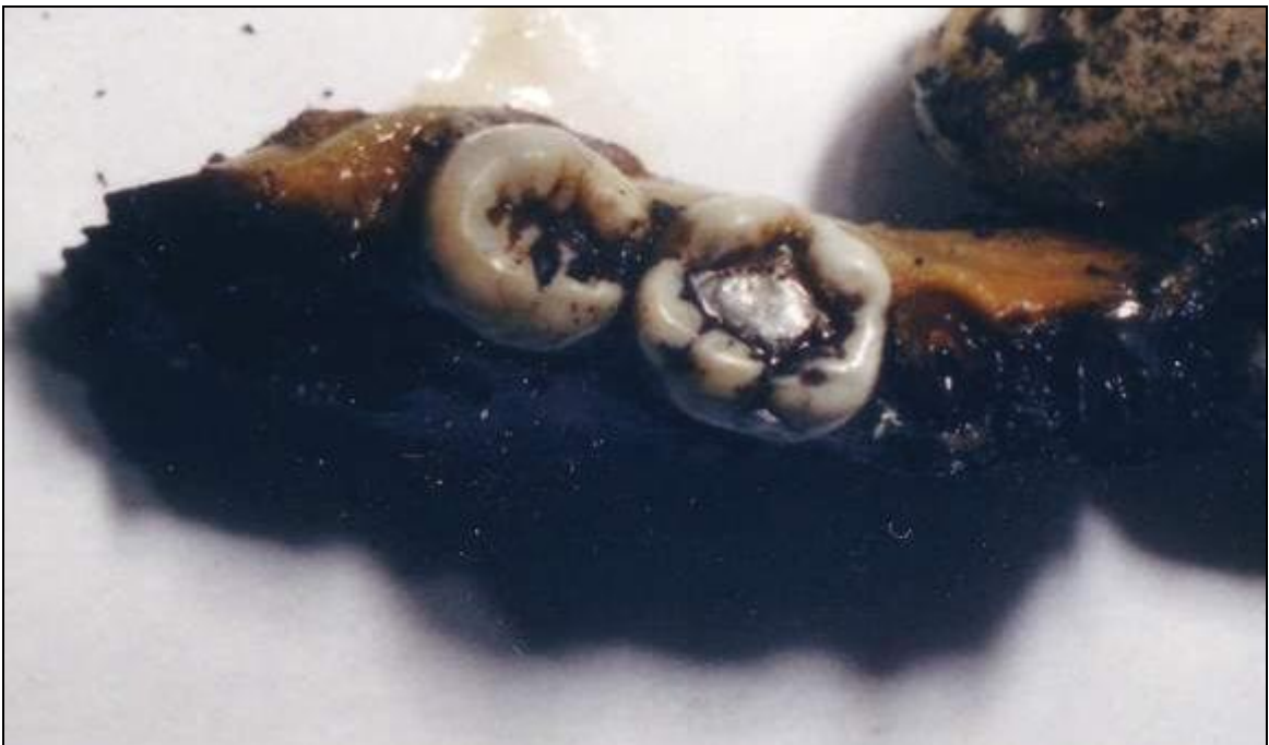
Photo 2 – right mandible fragment, – 45, 46, amalgam filling on occlusal face of 46; intense carbonization of the bone